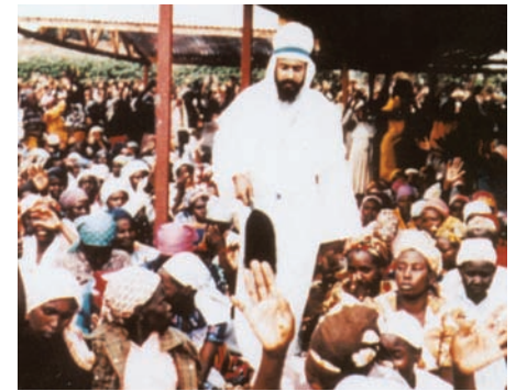
Maitreya as he appeared in Nairobi in 1988.

Political changes – In the political arena, for almost three decades we have been witnessing the breakdown of old repressive regimes around the world and the exposure of rampant corruption in government and business. Several major unexpected events have taken place, made possible only by Maitreya’s influence: apartheid ended in South Africa with the election of Nelson Mandela to the Presidency, following his release from an unjust, 27-year imprisonment. The Soviet Union dissolved into independent states. The Cold War ended, and East and West Germany reunited after the destruction of the Berlin wall. And, increasingly, governments around the world have had to give way to the “voice of the people.”