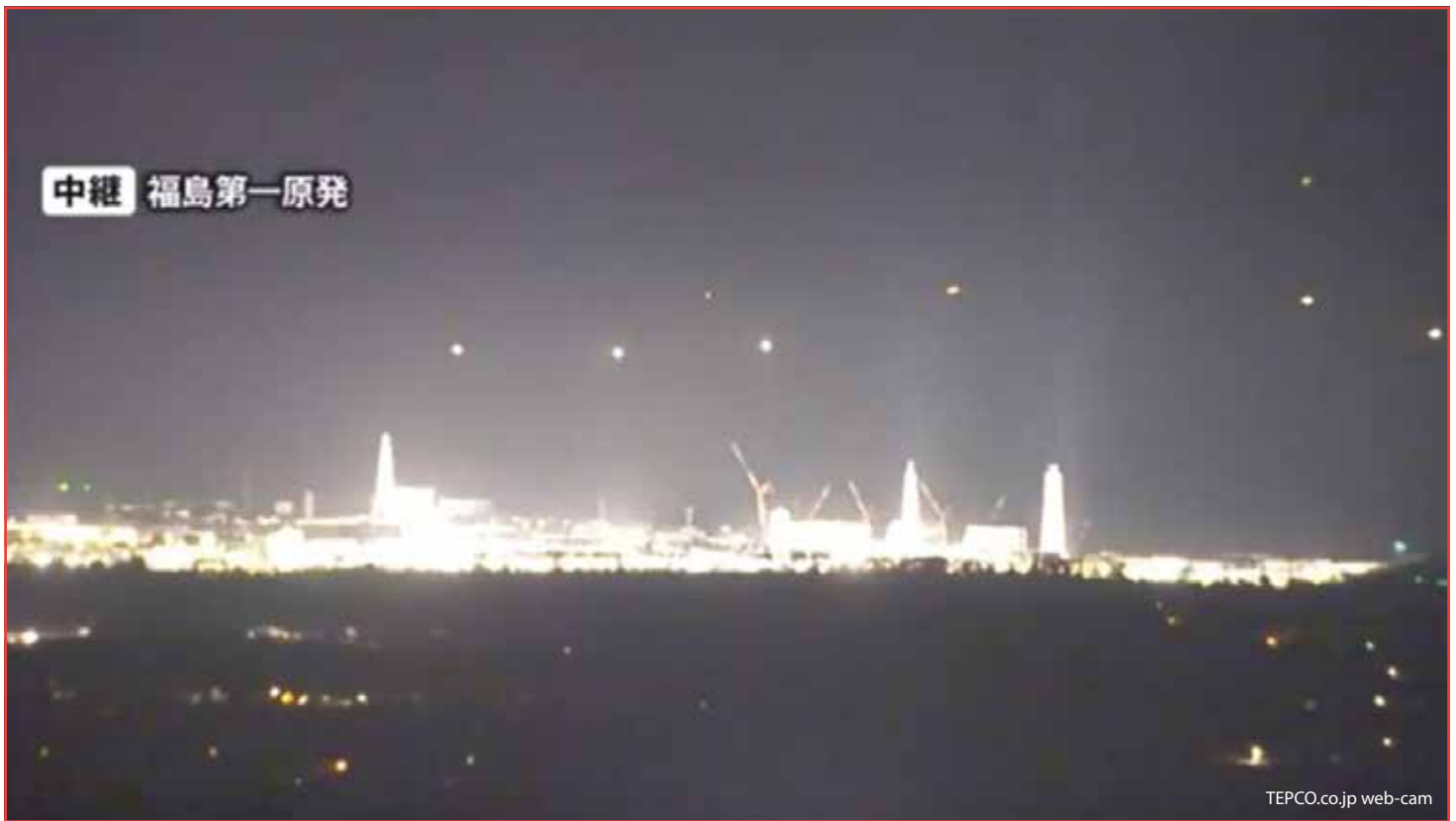
UFOs over the Fukushima Daiichi nuclear power plant, just after the accident following the earthquake and tsunami in March, 2011